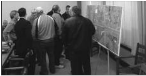
Staff of ODOT, members of the community and city personnel met Wednesday evening, Nov. 30, to discuss the preliminary plans for the 598 widening project, set to begin the spring of 2014.

State Route 598 will be widened from two lanes to three. Temporary rights of way will remain in place until the project is finished, when the rights of way will be given back to the prop-